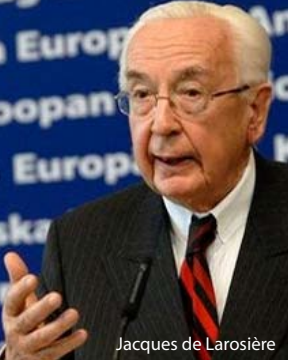
Jacques de Larosière