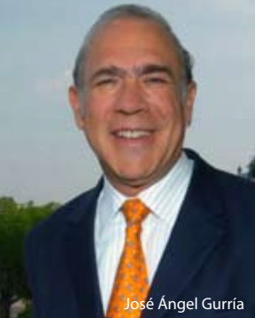
José Ángel Gurría