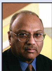
C.K. Prahalad, Author, The Fortune at the Bottom of the Pyramid , Professor, University of Michigan

The world's most exciting, fastest-growing new market is where you would least expect it – at the bottom of the economic pyramid. Collectively, the world's billions of poor people have immense entrepreneurial capabilities and buying power. Companies can learn to serve this market profitably and, at the same time, help the world's poorest people escape poverty.